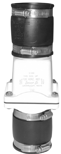
30-0021 PVC PLASTIC