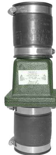
30-0151 CAST IRON