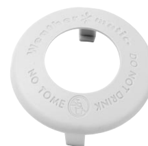
LX Non-Potable Cover