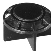
LX Check Valve