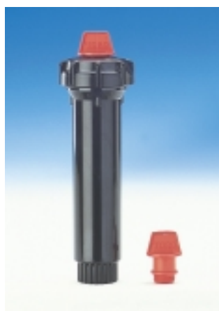
Environmentally friendly, biodegradable flush plug