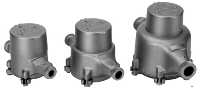
5/8" (DN 15mm) SR II®