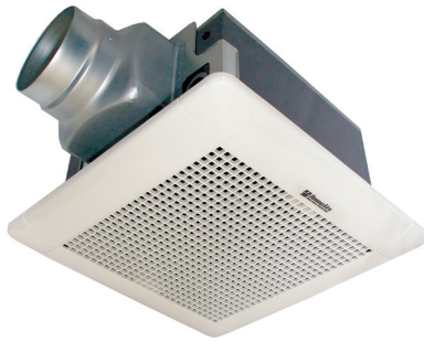
V50 V80 V110

S&P's V-Series Bathroom Fan by RenewAire, an S&P Company, is the best choice for exhaust-only ventilation. The V-Series improves indoor air quality and increase's your homes durability by quickly exhausting contaminants and excess moisture that can cause health issues, mold growth and structural damage.