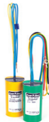
SD210TURF Sensor Decoder