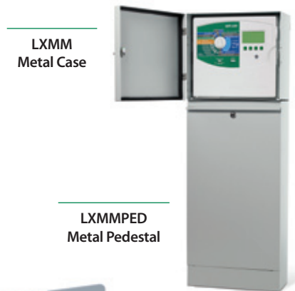
LXMM Metal Case

The ESP-LXD Controller has an optional LXMM Metal Wall-Mount Case and LXMM-PED Metal Pedestal. The ESP-LXD standard plastic case field installs into the LXMM and can be wall-mounted or attached to the LXMPED for free-standing controller applications. The LXMM and LXMM-PED use powder-coated steel for years of rust-free operation.