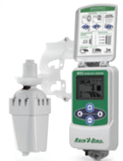
WR2-RFC Wireless Rain/Freeze Sensor

The ESP-LXD supports up to 4 weather sensors, one local and up to three additional on the two-wire path interfaced with SD-210 sensor decoders. Supported Rain Bird sensors include the RSD wired rain sensor, the WR2-RC wireless rain sensor, the WR2-RFC wireless rain/freeze sensor and the ANEMOMETER wind sensor (the Rain Bird 3002 Pulse Transmitter is required for use of the ANEMOMETER). Soil moisture sensors that provide a normally closed switch interface are also supported.