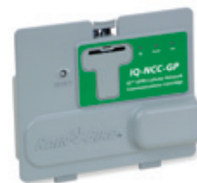
IQ NCC-GP Communication Cartridge