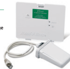
ETC-LX ET Manager Smart Cartridge

The ESP-LXD Controller can be upgraded to a weather adjusted Smart controller with the addition of the ETC-LX ET Manager Cartridge. The ET Manager upgrade kit includes a cartridge that installs in the back of the controller front panel and an antenna that installs through a knock-out in the top of the controller case. The ETM receiver collects hourly weather station sensor data via a wireless paging signal. This data is used to calculate an Evapotranspiration (ET) value and irrigation is automatically adjusted to apply only the amount of water needed.