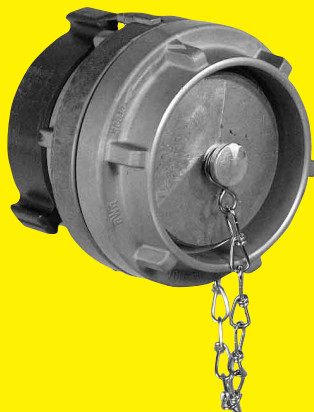
5795-01 & 5799-01