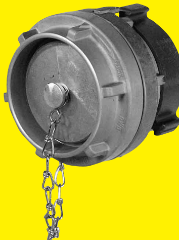
5795-04 & 5799-01

Call for availability of other STORZ configurations