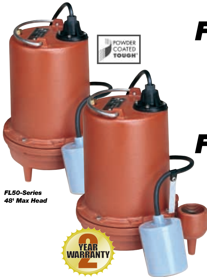
FL50-Series 48' Max Head