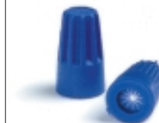
WIRE STRIP LENGTH: 1/2"