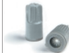
WIRE STRIP LENGTH: 1/2"