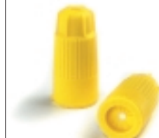
WIRE STRIP LENGTH: 1/2"