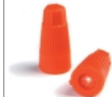
WIRE STRIP LENGTH: 1/2"