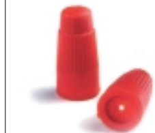
WIRE STRIP LENGTH: 1/2"