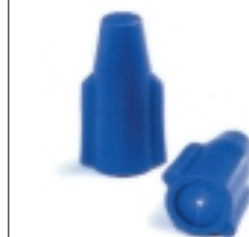
WIRE STRIP LENGTH: 7/8" - 1"