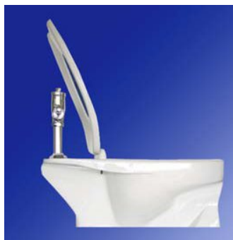
Self-Sustaining Check Hinge - External self-sustaining check hinge holds seat in any raised position up to 11 degrees beyond vertical