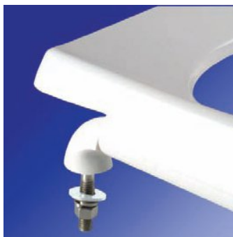
Check Hinge - External check hinge with 304 series stainless steel hinge posts stops seat 11 degrees beyond vertical