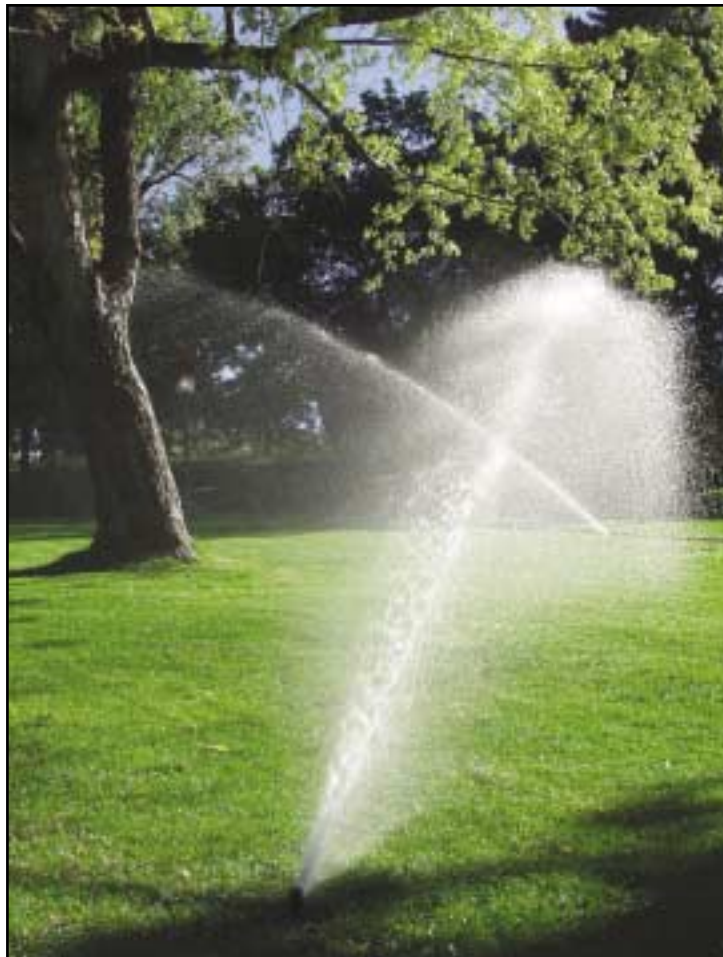
Quik-Irr Software is the fastest, most accurate way to build a complete material list for an irrigation system.