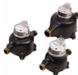
5/8 SR-EC 3/4" SR-EC 1" SR-EC (DN 15mm) (DN 20mm) (DN 25mm)