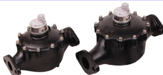
1-1/2" SR® (DN 40mm)

CONNECTIONS: Tailpieces/Companion Flanges for installing the meters on a variety of pipe and sizes are available as an option. For flanged meters, the use of a Smith-Blair Model 926 Flanged Coupling Adapter is recommended to facilitate the installation and any future removal of the meter from the line.