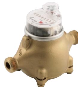
5/8" SR-EB AMR (pictured) 3/4" and 1" available