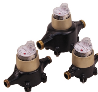
Shown with ICE Registers