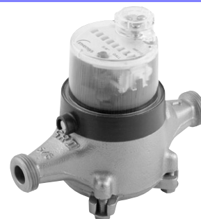
5/8" SR II-EB AMR (pictured) 3/4" and 1" available