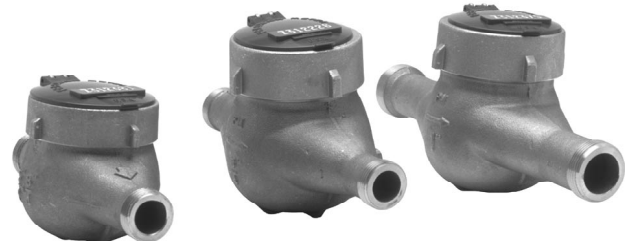
5/8" PMX® (DN 15mm)