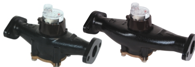
1-1/2" PMM-EC® (DN 40mm)