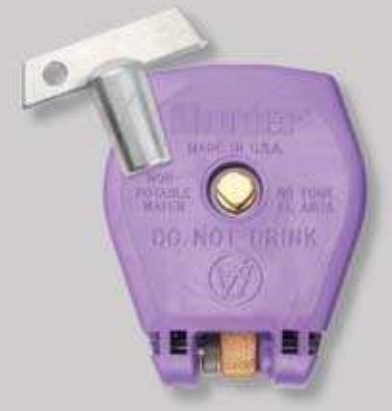
All locking models have an optional purple TuffTop ^{\text{TM}} cover for sites using reclaimed water.