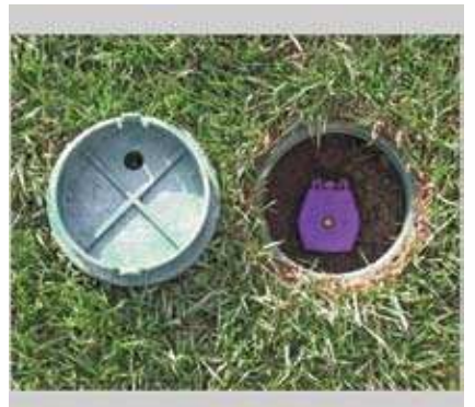
Installing a quick coupler allows your site to have water wherever it's needed.

Positive closing and protection for valve's sealing components