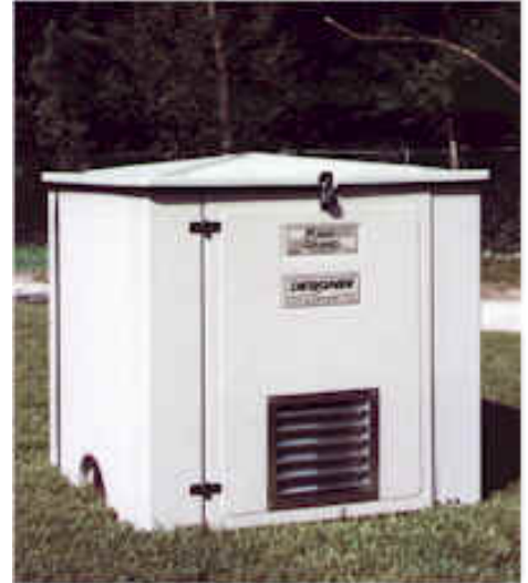
Models No. PG4000 - PG8000

for most pumps 1/2 HP Inside Dimensions 27"L x 13"W x 23"H