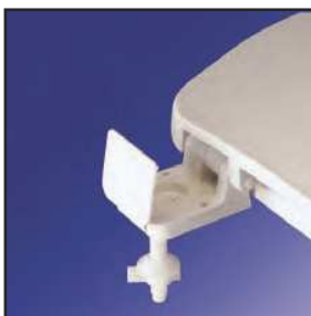
Corrosion proof, self-aligning hardware