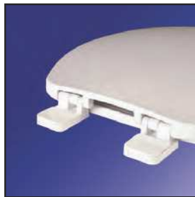
Factory-installed "living" hinge covers