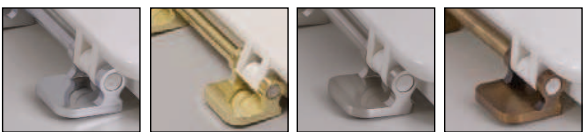
Chrome Brass Brushed Nickel Oil Rub