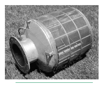
Rain Bird's Self-Cleaning Pump Suction Screen is built for years of trouble-free service

Contact Rain Bird for drawings or visit www.rainbird.com to download.