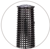
Diameter: 2" Length: 9"