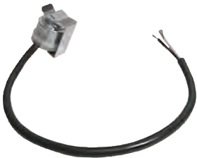
Fig. 5 AquaStat