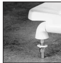
CONCEALED CHECK HINGES WITH 300 SERIES STAINLESS STEEL POST

Ring thickness including the bumper is 1-3/16"