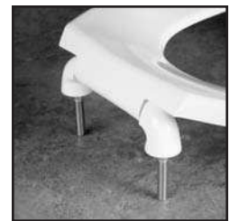
CONCEALED CHECK HINGE