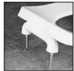
EXTERNAL CHECK HINGE