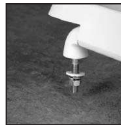
EXTERNAL CHECK HINGES WITH 300 SERIES STAINLESS STEEL POST

Ring thickness including the bumper is 1-3/16"