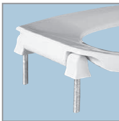
PLASTIC HINGES WITH STAINLESS STEEL POSTS AND PINTLES