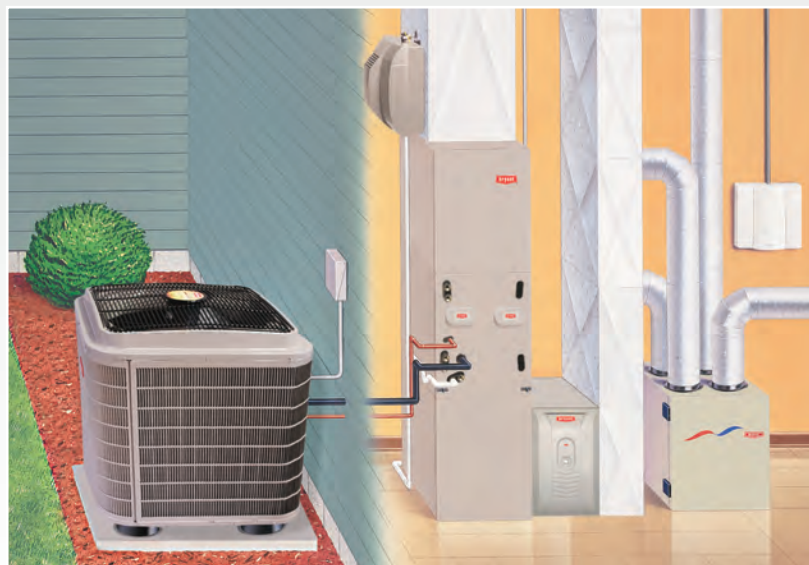
Heat Pump and Fan Coil System