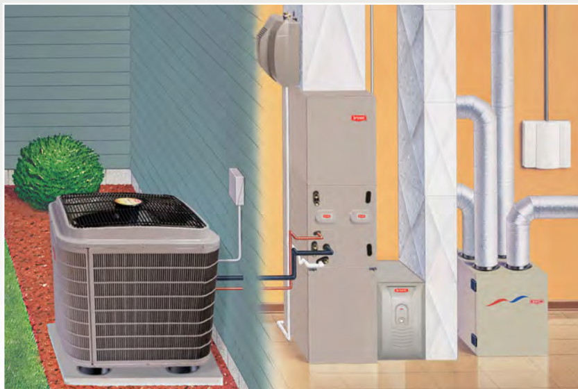
Heat Pump and Fan Coil System