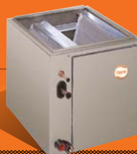
— Cased Vertical N-Coil CNPVP / CNPVT