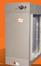
— Cased Slab Coil CSPHP