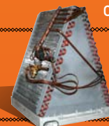
— Uncased Vertical A-Coil CAPVU