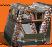
— Uncased Vertical N-Coil CNPVU