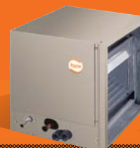
— Cased Horizontal N-Coil CNPHP