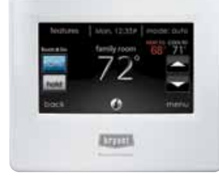
The optional Evolution<sup>®</sup> Connex<sup>™</sup> control is much more than just a thermostat. It is your single source of precision temperature, humidity and indoor air quality control.